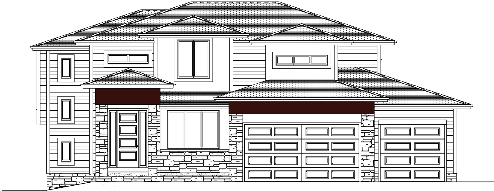
Two-Story Basement Walkout Plan